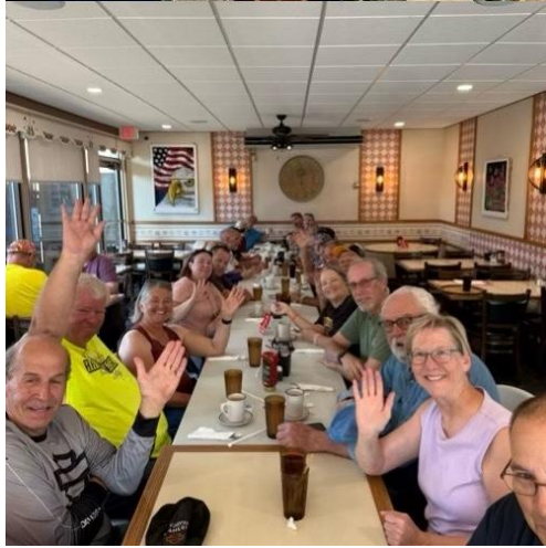
BRUNCH RIDE JULY 2025